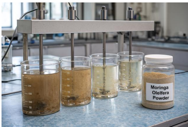
Fig. 1. Jar-Test setup

After settling, the supernatant from each beaker was carefully extracted without disturbing the settled flocs. The remaining turbidity was measured using a calibrated nephelometer, and the turbidity reduction efficiency was calculated by comparing influent and effluent values.